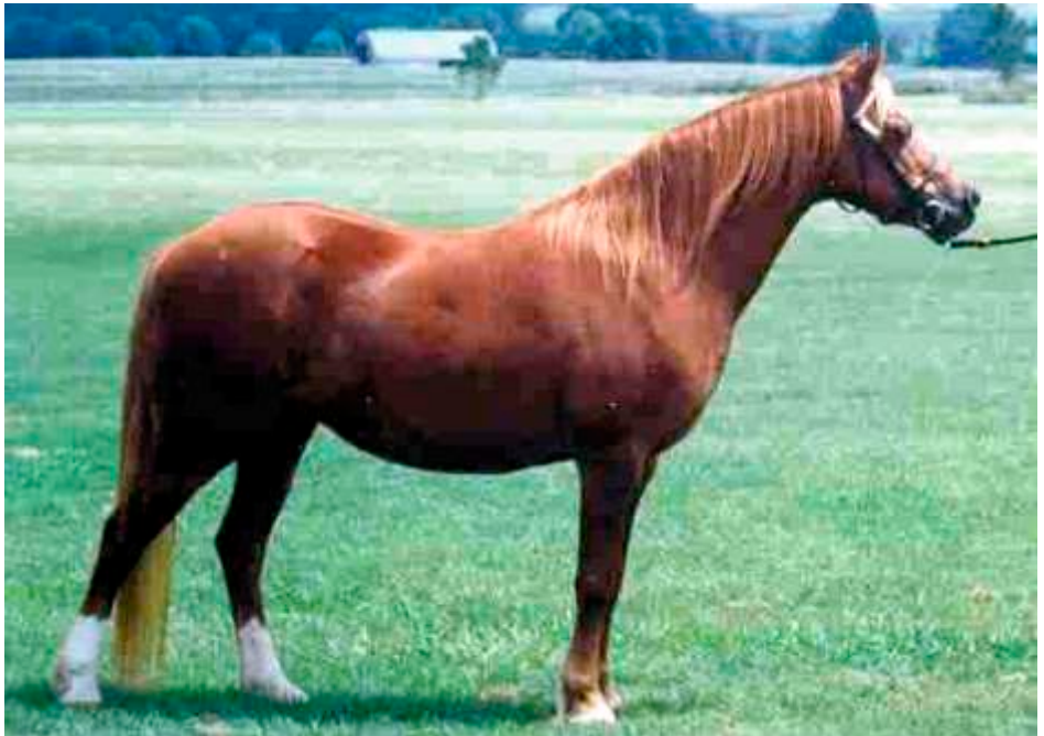
Braidwynn Desert Rose