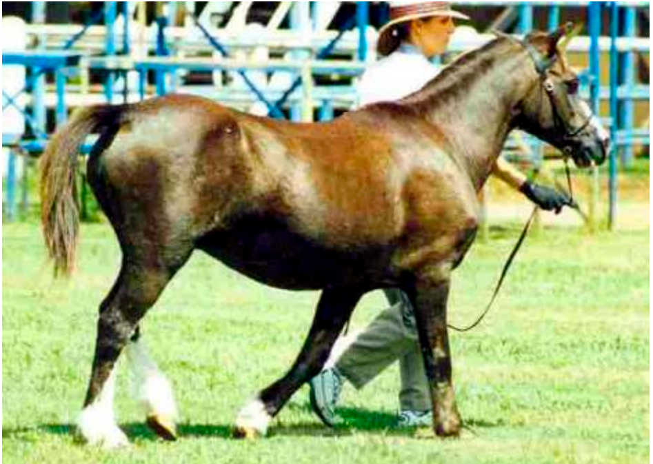
Aberdare Flame Lily