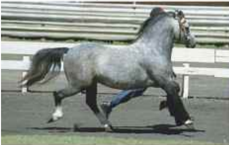
Millstone Buck, Sec A Stallion 4-6 5th