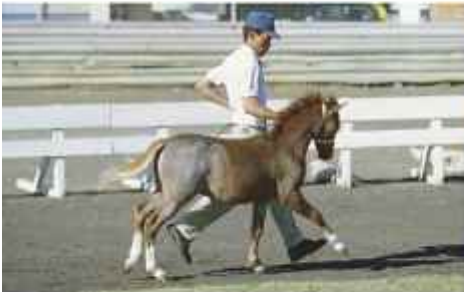
Llandilo Fahrenheit, Sec A Colt foal 2nd