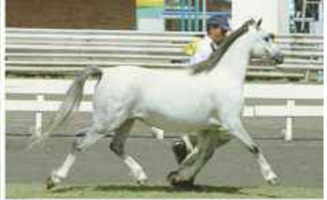
Llandilo Vanity Fair, Sec A Mare 4-6 1st