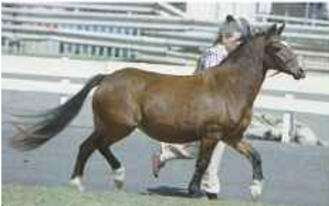
Koosbad Posy, Sec A Mare 6-10 4th