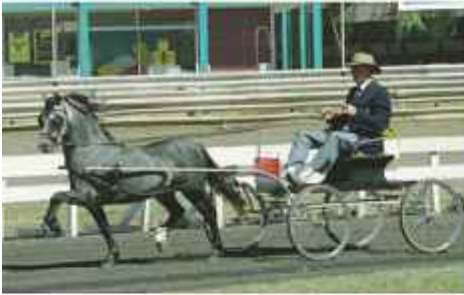
Millstone First Borne