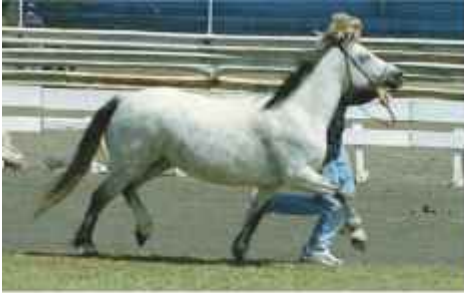
Fairbourne Farushka, Sec A Mare 6-10 3rd