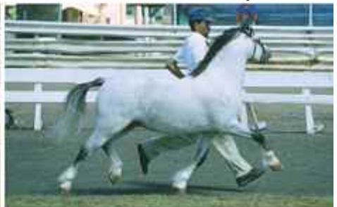
Llandilo Squire, Sec A Res Snr Ch Stallion