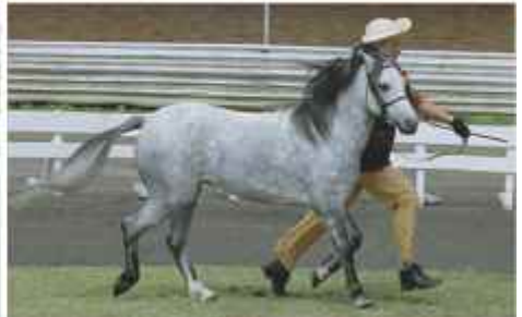
Owensley Artemis Sec A Mare 4-6 3rd