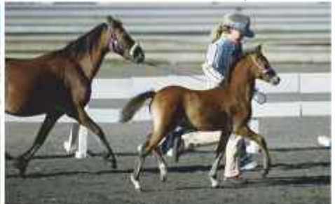
Sparkling Fairy Belle, Sec A Filly foal 2nd