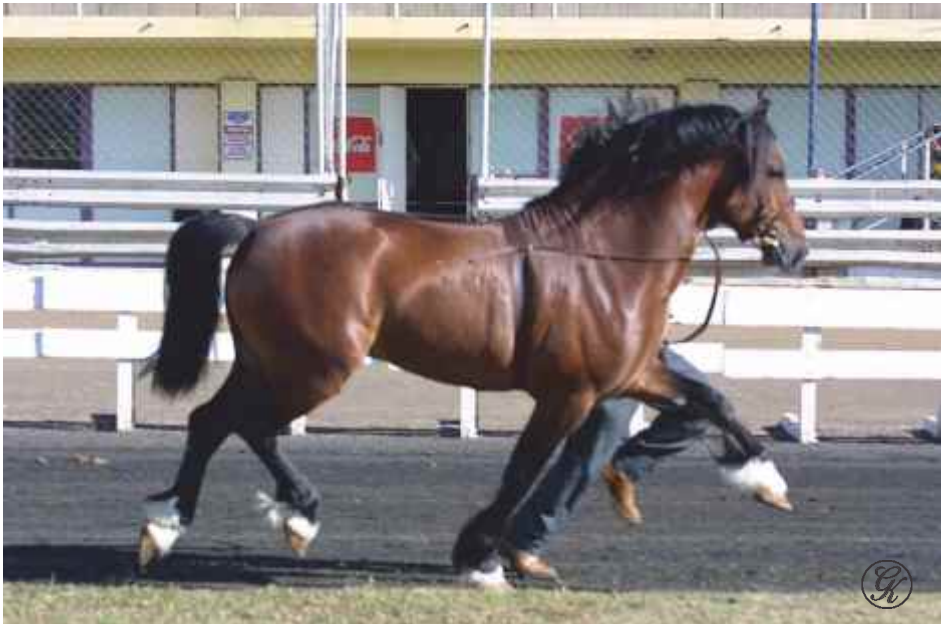
Section C/D Junior Champion and Supreme Reserve Champion: Danaway The Sting