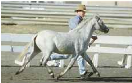
Staten Bismark, Sec A Colt foal 4th