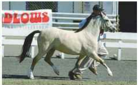
TJ Hooker Miss Twinkle