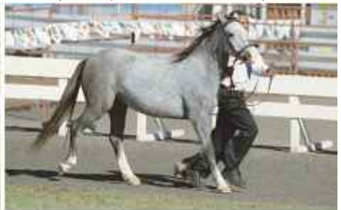
Fairbourne Fariza, Sec A Colt foal 3rd