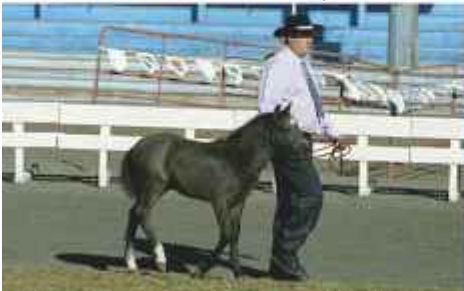
Llanelli Sadam, Sec A Colt foal 5th