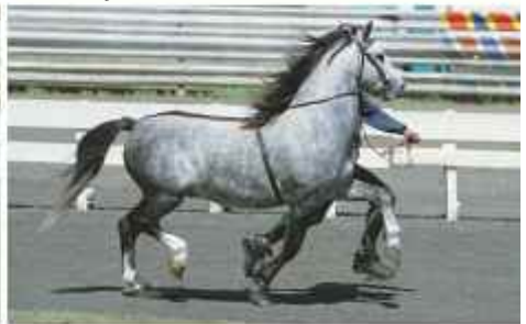
Koosbad Hywel, Sec A Stallion 4-6 2nd