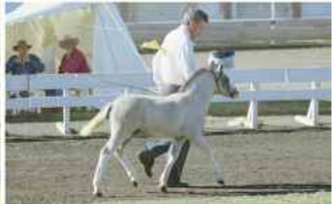
Marijani Royal Secret, Sec A Colt foal 1st