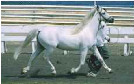
Koosbad Pagad, Sec A Stallion 4-8 3rd