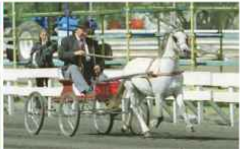
Haelline A Song