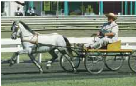
Glenwesh Royal Jester