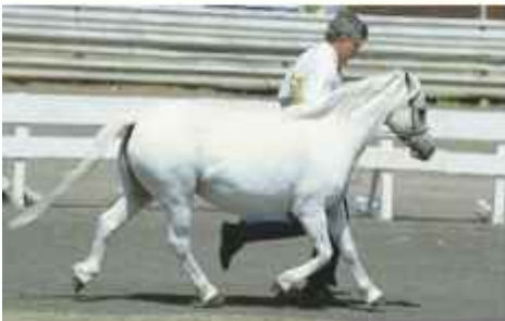
Llandridod Rebel Rosabelle Mare 6-10 4th