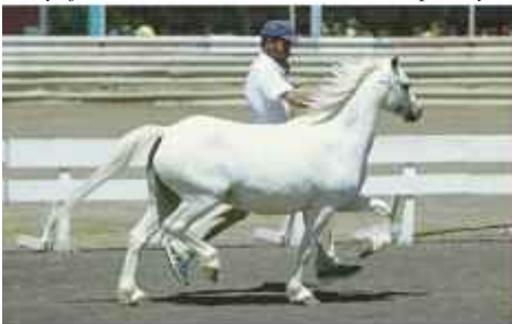
Llandilo Snowfinch, Sec A Res Snr Ch Mare