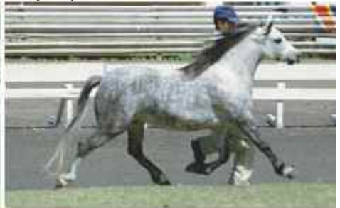
Llandilo Fiji, Sec A Mare 6-10 2nd