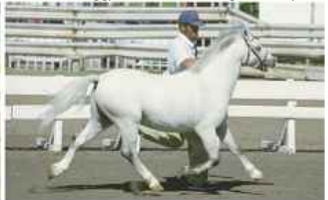
Llandilo Sabre, Sec A Jnr Champion Colt