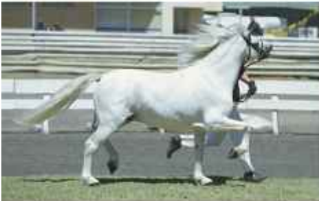
Staten Might, Sec A Stallion 6-10 2nd