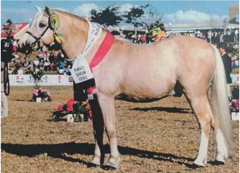
Foresyte Cambrian Golden Gorse here at the 1990 Rand Show

Africa's major show Rand Easter Show. In the 1980's and 1990s the Rand Show grew bigger every year. It ran for two weeks, attracted many thousand equestrian entries and was attended by huge enthusiastic crowds. Golden Gorse had been shown in hand, ridden and driven by a child and his progeny had wonderful temperaments straight legs and could move well. In 1988 in a Partbred Welsh Show Riding class with 18 entries first to fourth were all by Golden Gorse. As his foals arrived, they were exactly what I wanted. So why change to another stallion? The first nine Dimmock foals were all by Golden Gorse.