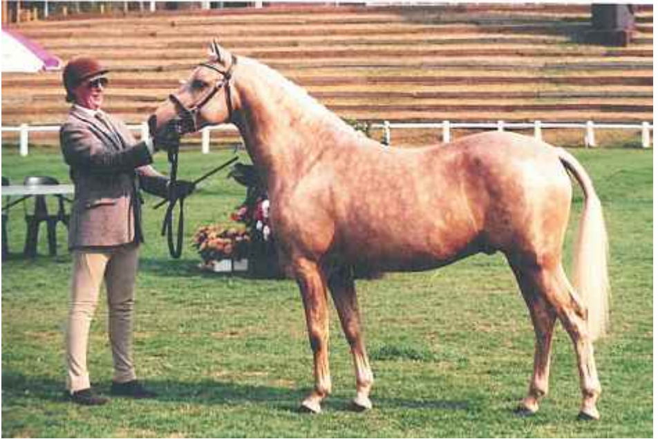
Dimmock Dragonfly being shown by the author in 1994