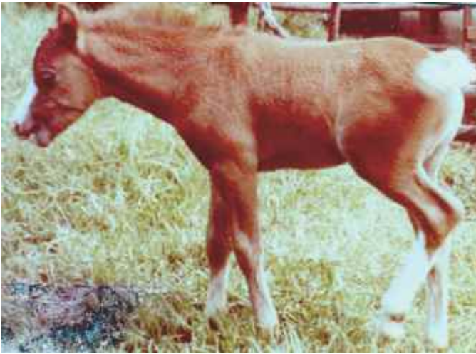
Hydown Pip as a foal