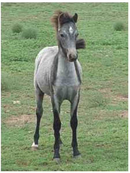
Payayhu Snow Girl