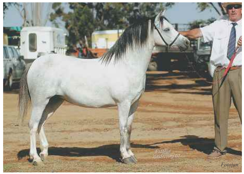
Palayhu Vic's Dream