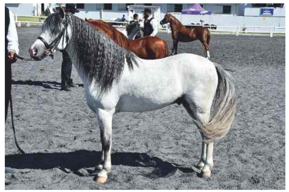
Pajayhu Snow Boy