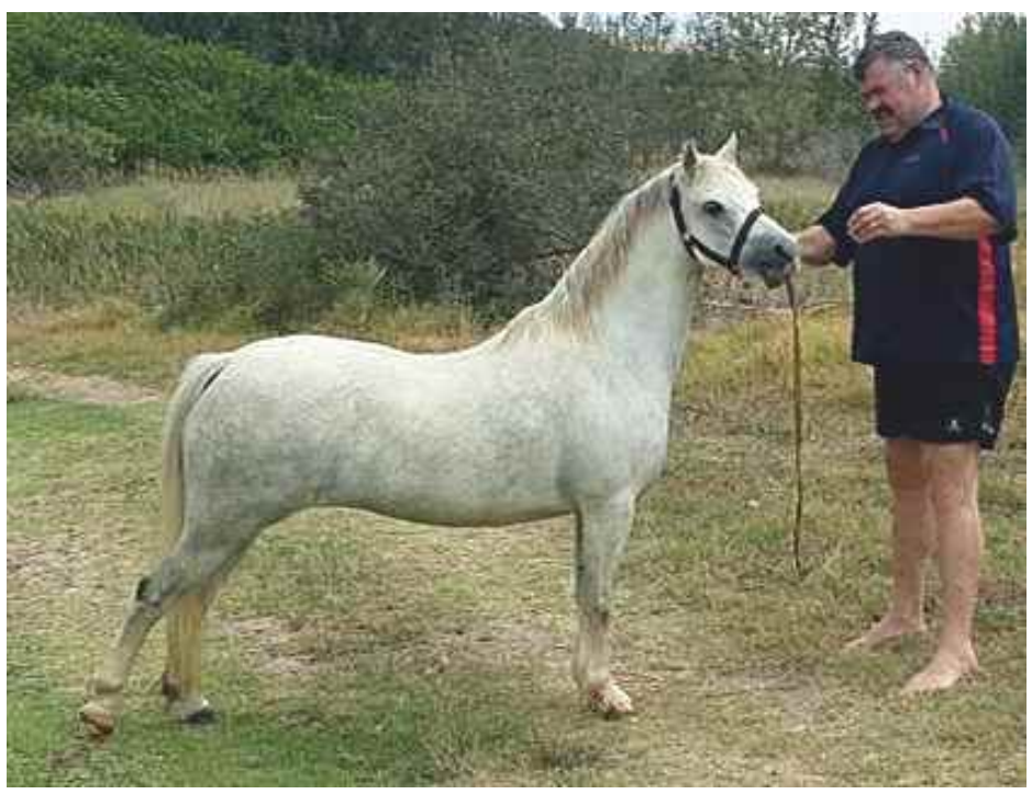
Pajayhu Snow Lilly