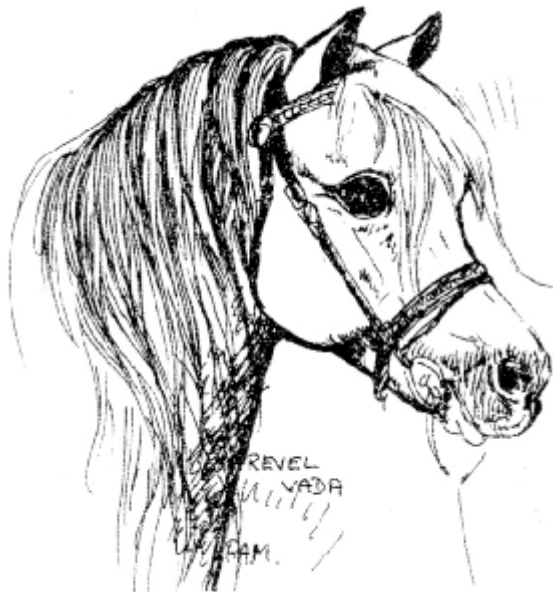
Llandilo Vada's Supreme at the 1997 Nationals. colt 2-4 but unplaced