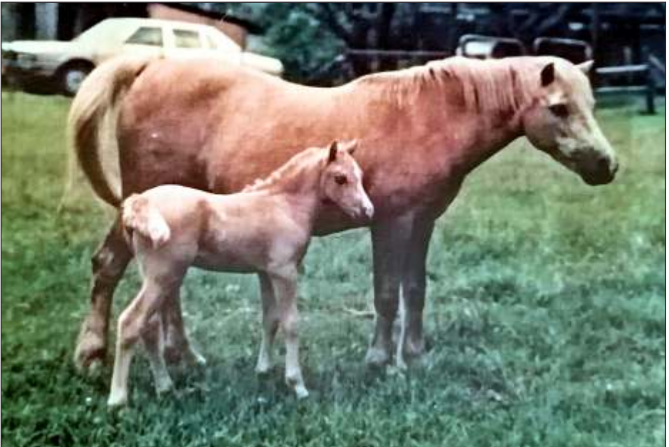
Belvoir Gazania together with her last foal, Foresyte Bannut Golden Cloud by Bannut Larkspur

The Export Certificate was issued on 5 December, 1968, and she must have been in foal, the stallion not specified, because on 2 February, 1969, a filly foal was born dead. She attended her first Lowveld Show in 1969 and was placed 1 st in the class for Brood Mare 14.2hh & under.